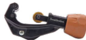
Jacket Cutter/Conduit Scorer